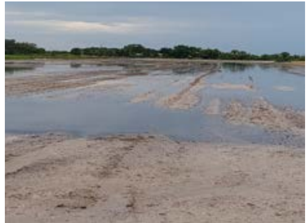
Flooded Field in Arcadia, FL