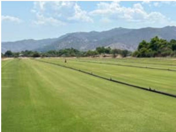
Foundation TifTuf Field, Escondido, CA

Currently GSD has two Foundation Turfgrass Production fields outside of Georgia. One is a TifTuf Bermudagrass Foundation field in Escondido, CA. This field has been in CA since 2016. I was recently out in Escondido to inspect the field prior to harvested sprig material going to Arizona. The field was approved for harvest and the grass was shipped to the licensee. GSD has also established a SeaScape Paspalum Foundation field in Arcadia, FL. This field was established in 2023. We have been trying to harvest this field for a licensee on the East Coast of Florida, but the weather has not been cooperating. The licensee had hope to get planting material last week, but the farm was flooded by a storm and then again by Hurricane Debby.