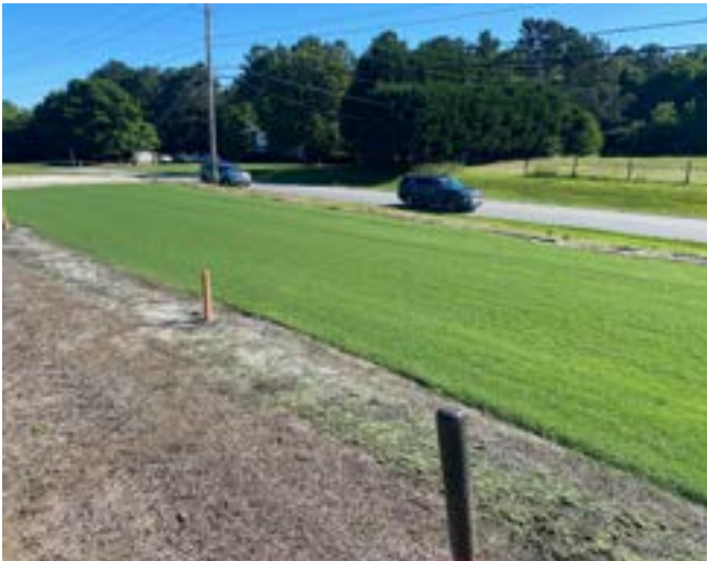
Foundation Tif3D Athens, GA