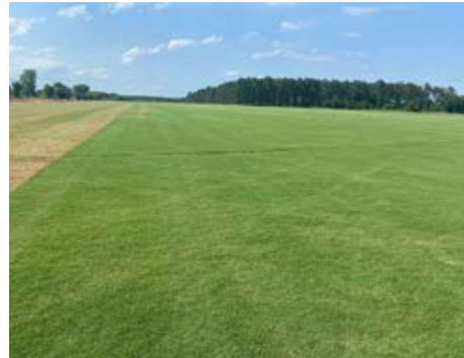
Foundation TifTuf Field Marshallville, GA