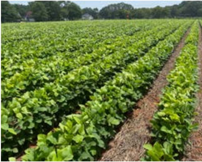
Foundation Soybean Field, G21-10769RR-T in Watkinsville, Georgia