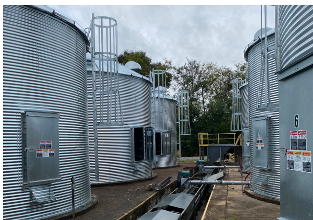
CURRENT PROGRESS ON NEW GRAIN BIN INSTALLATION IN ATHENS, GA