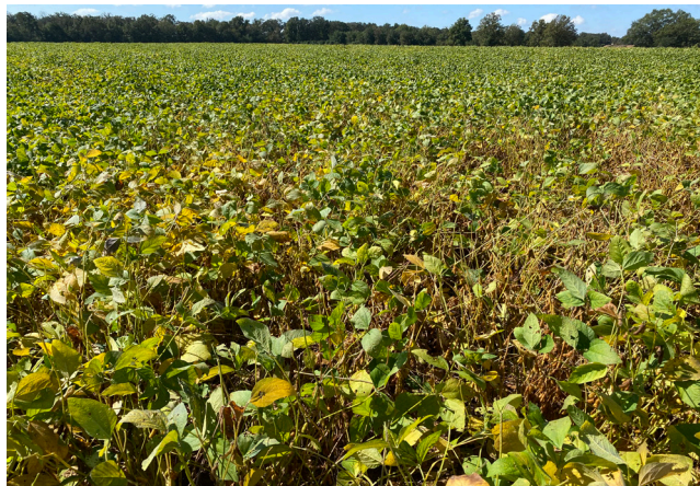
FOUNDATION SOYBEANS IN PLAINS, GA