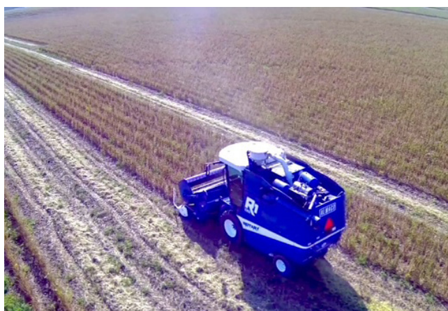
FOUNDATION SOYBEAN HARVEST IN PLAINS, GA