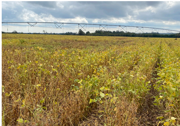
ROGUING AGS 738RR IN SOUTH CAROLINA