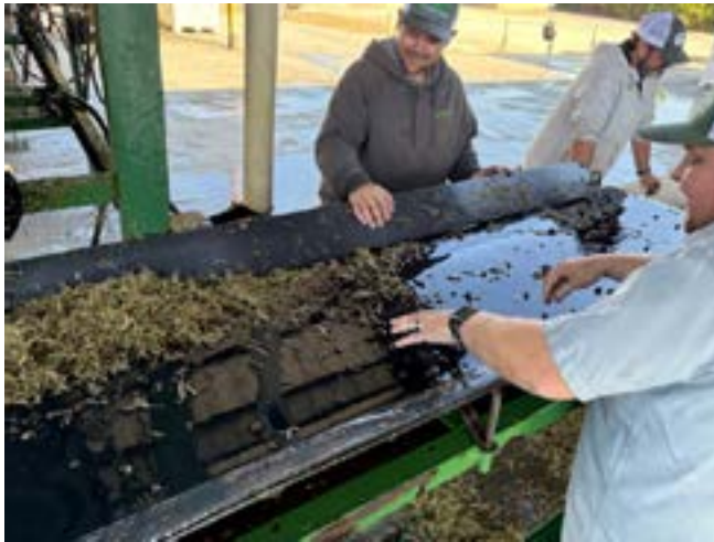
Washing TifEagle Springs for Foundation Planting in Adel, GA