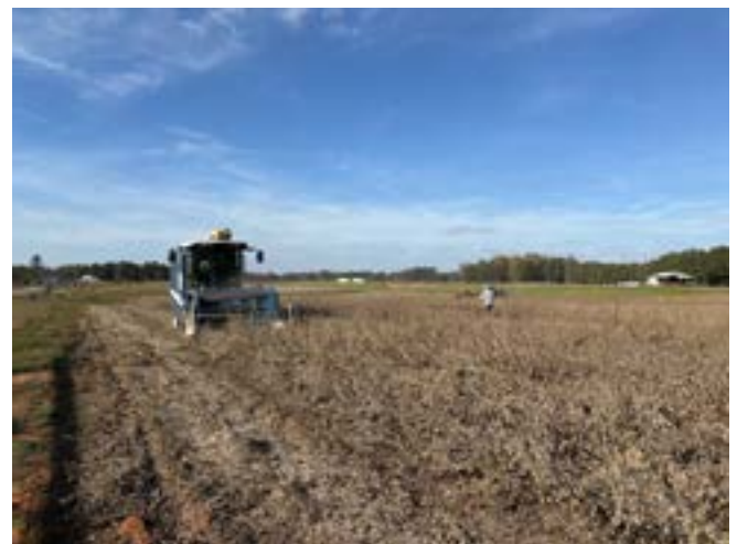
Harvesting an indeterminate soybean line at the J. Phil Campbell R&E Center