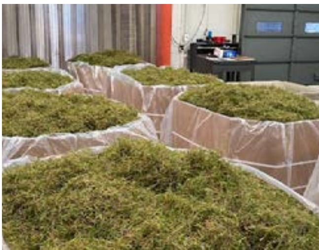
TifEagle Foundation sprigs ready for shipment in Athens, GA