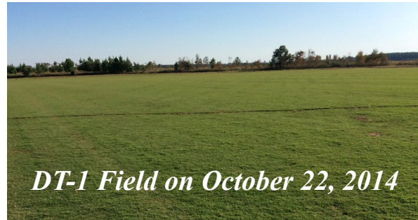
DT-1 Field on October 22, 2014

Sea Isle Supreme : No orders at this time.