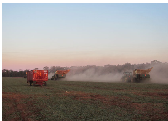
GA-12Y Harvest at Dusk